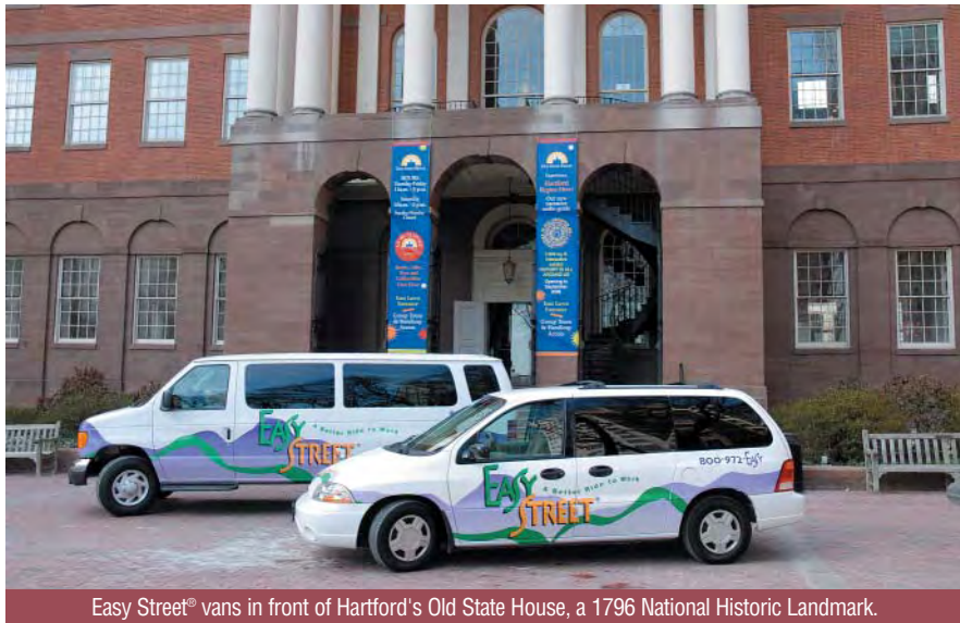
Easy Street® vans in front of Hartford's Old State House, a 1796 National Historic Landmark.

For more information and to schedule a fact-finding appointment, phone 860-692-1224 or visit www.rideshare.com .